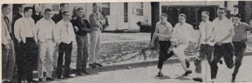
"THERE MUST BE A WAY" to win this race.