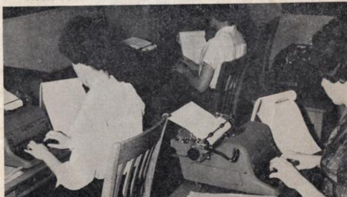
"WITH A LITTLE BIT OF LUCK" the girls eventually will achieve typing certificates.