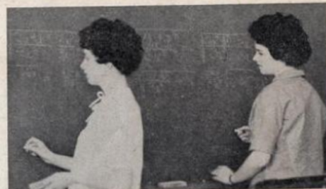
"MUSIC TO SUFFER BY" from the movie "The Ten Greatest Algebra Problems."