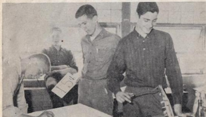
The boys are singing "YOU CAN DEPEND ON ME" as they finish their posters for the carnival.