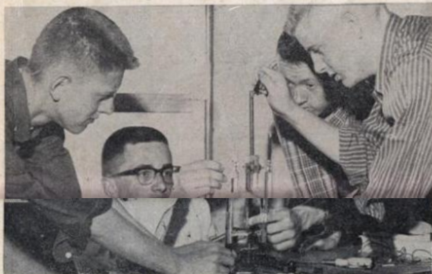
"WITCHCRAFT" or what looks like witchcraft is only a delicate physics experiment.