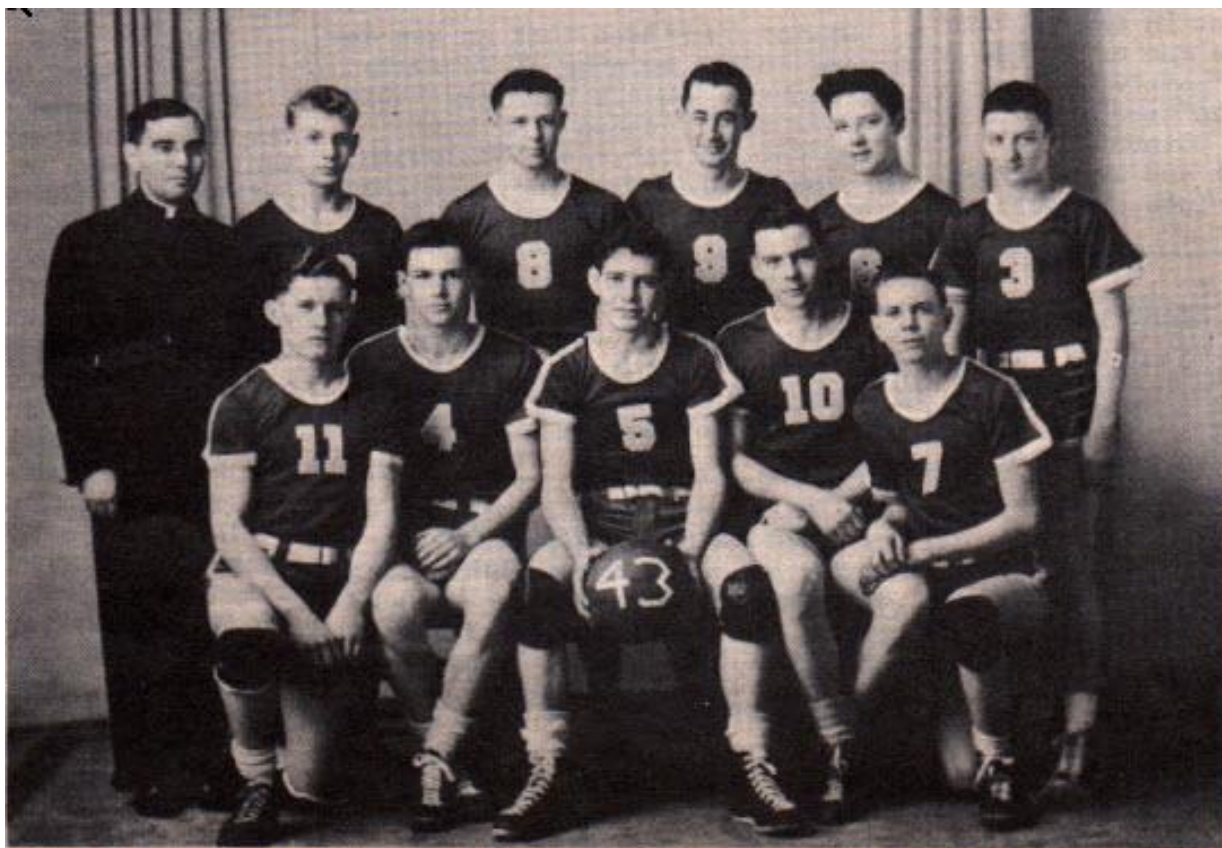
SHHS Basketball Team January 1943