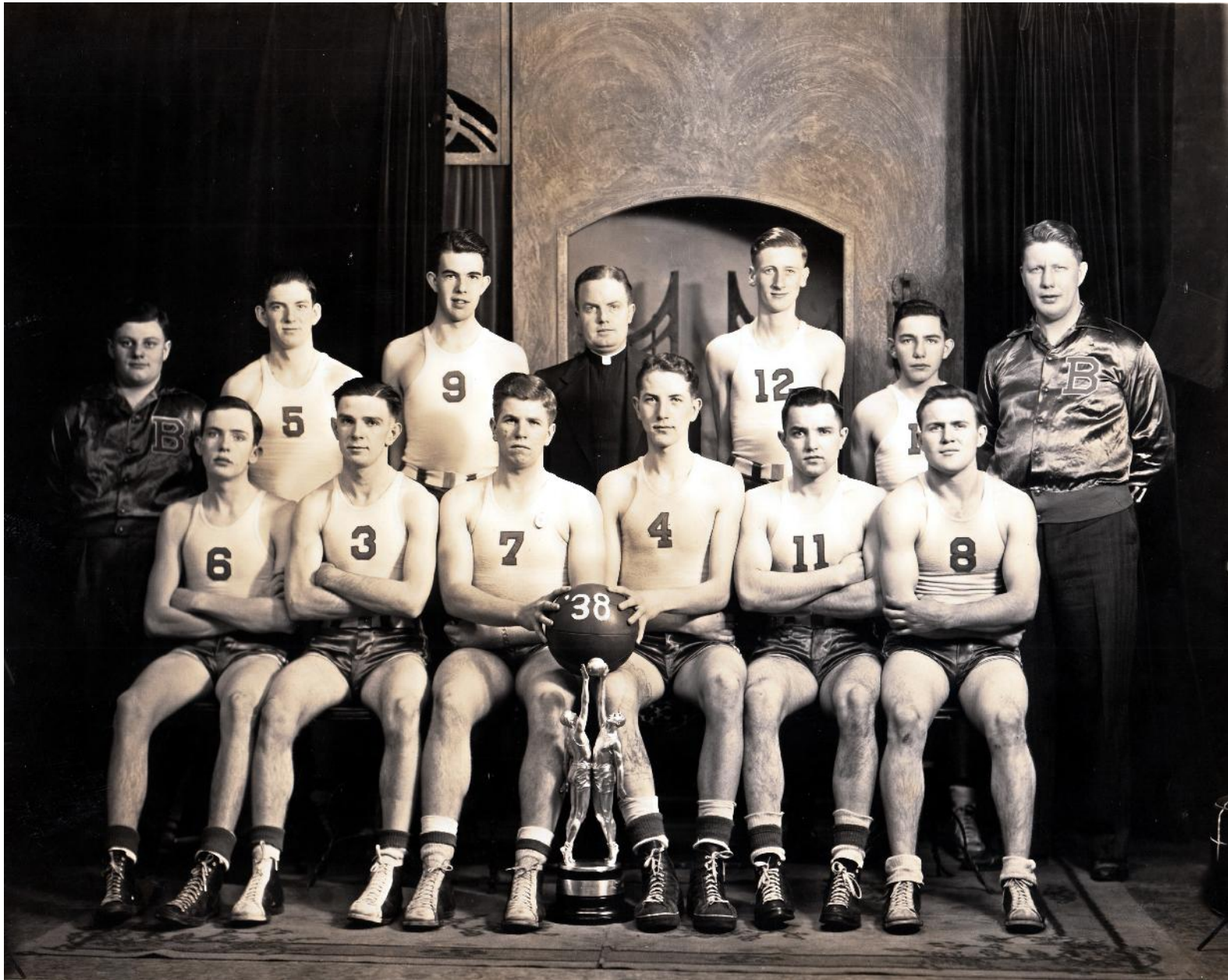
The 1938 Sacred Heart Basketball team.