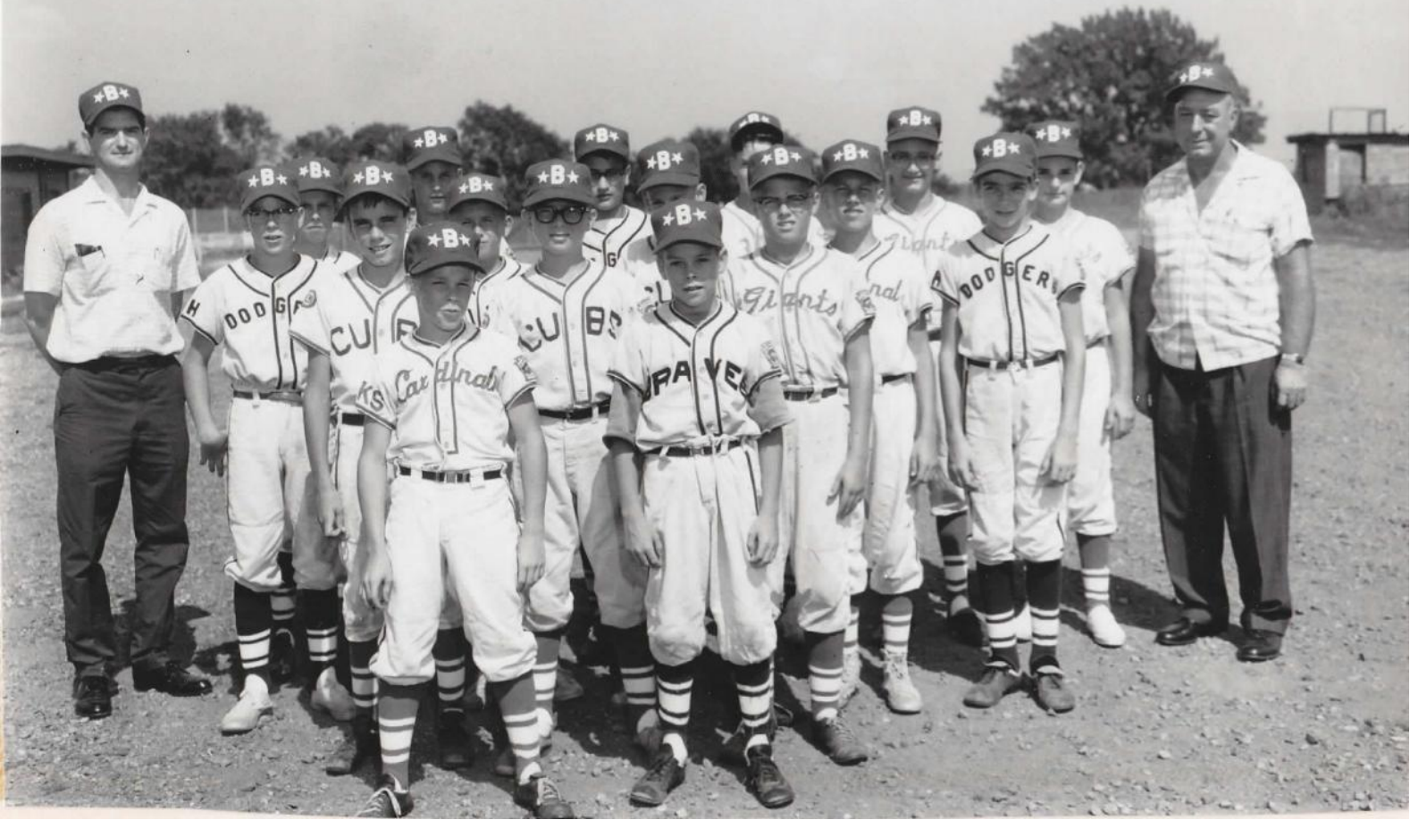
BOONE, IOWA 1964 ALL STARS