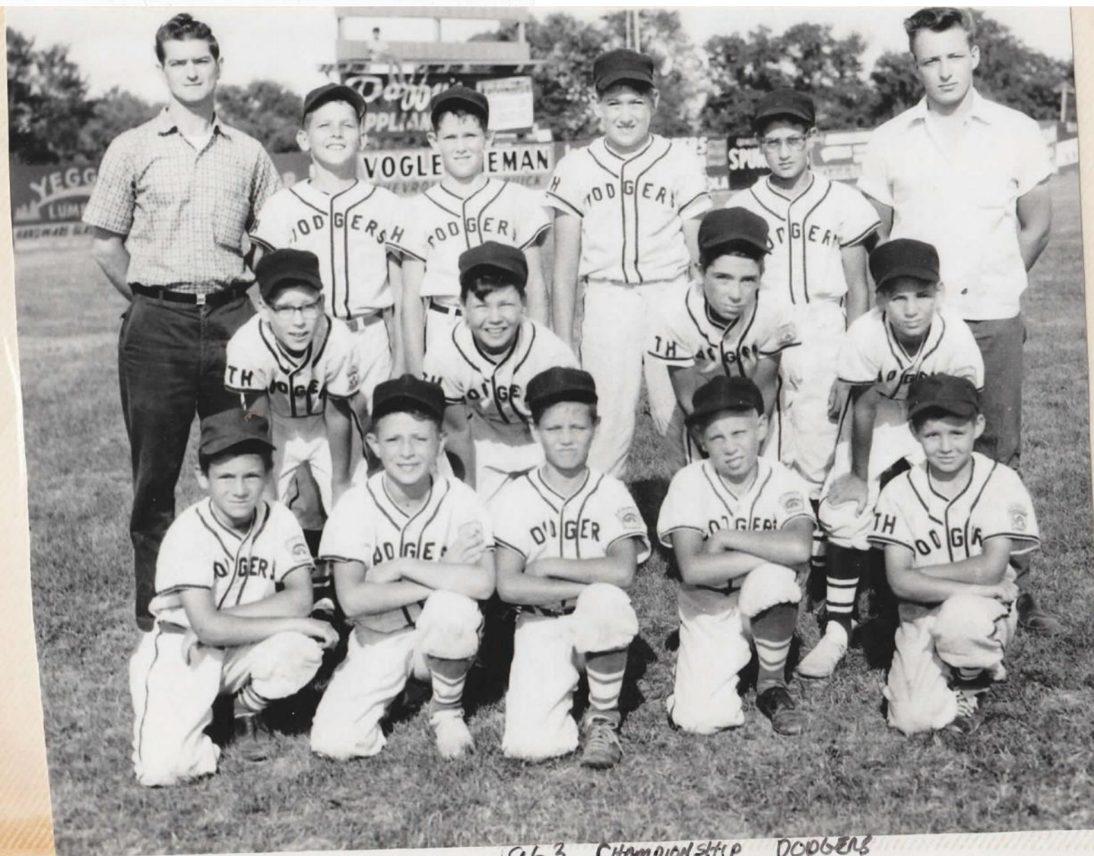
1963 CHAMPIONSHIP DODGERS