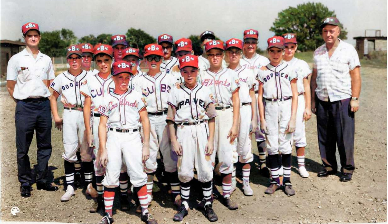
BOONE, IOWA 1964 ALL STARS