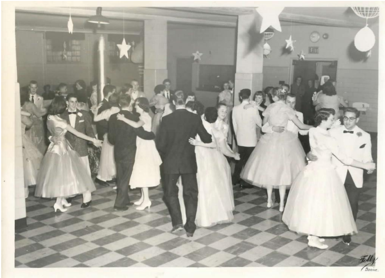
Sacred Heart Junior Senior Prom - 1956