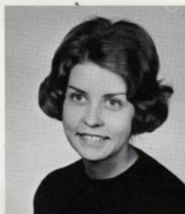
Rosemary Runyan-Boone High Twelve scholarship