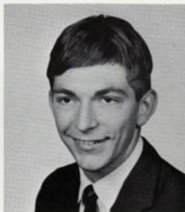
Terry Peterson-Robert Ashbaugh Memorial scholarship