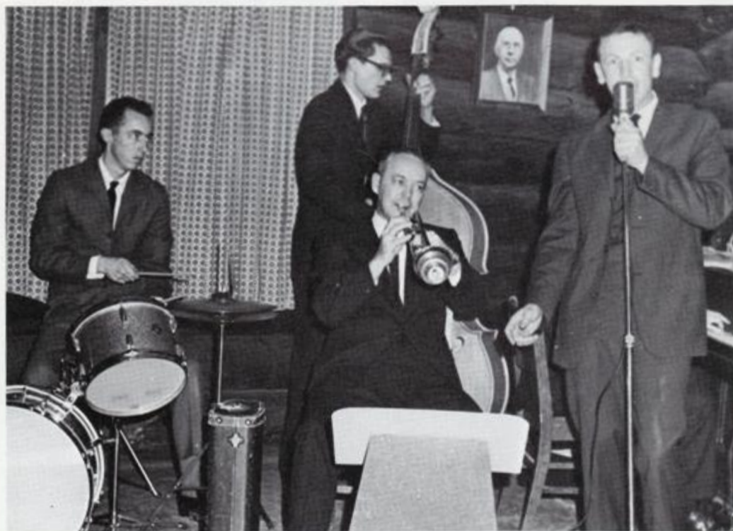
...good music provided by the Don J's.

...smelling flowers, perfume, men's cologne. ...seeing pretty gals, hand- some guys, and happy faces. ...hearing lovely music, flowing voices, and much laughter.