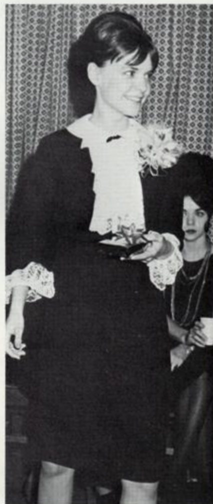
And just whom do you see, Judy, that puts that smile on your face and that twinkle in your eye?