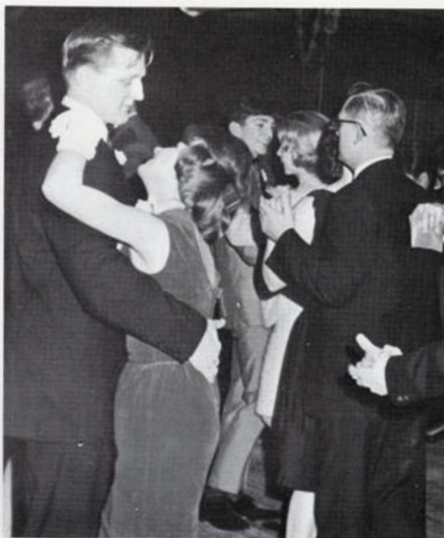
...dancing, drifting and dreaming.