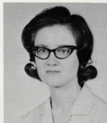
Judy Peters-Boone Educators' Association scholarship