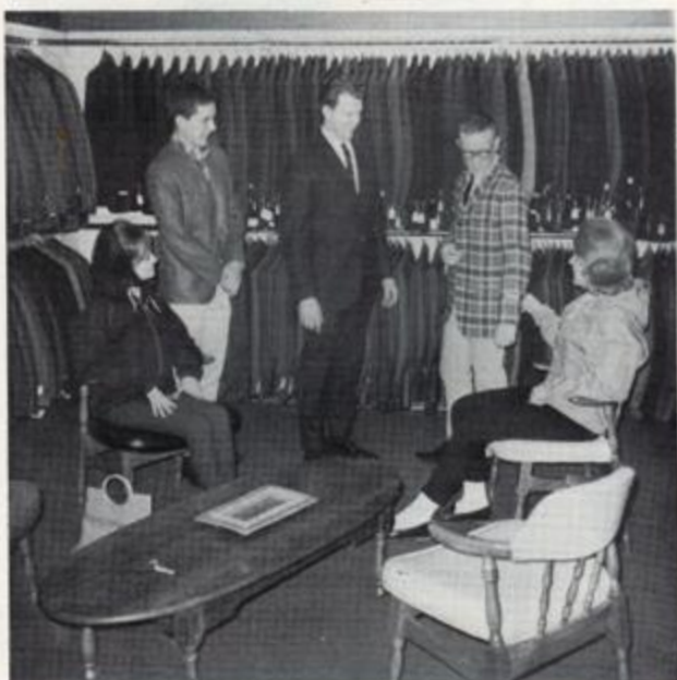
J. C. Petersen & Co. 811 Story