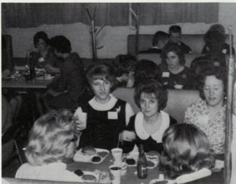
BJC students and guests ate lunch in the Boone Junior College snack bar.

Prospective Teachers' Day is held each year to encourage interested and qualified high school students in teaching as a career. The day is sponsored by the Iowa Commission of Teacher Education and Professional Standards, in cooperation with the Iowa State Education Association and the State Department of Public Instruction.