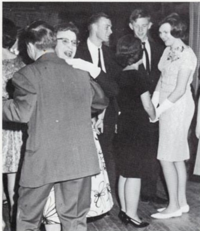
...laughter and talk.