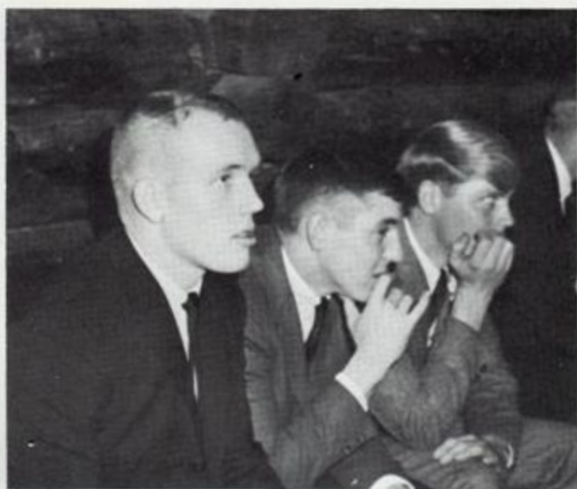
"Well, where did those girls go, and when will they be back?"