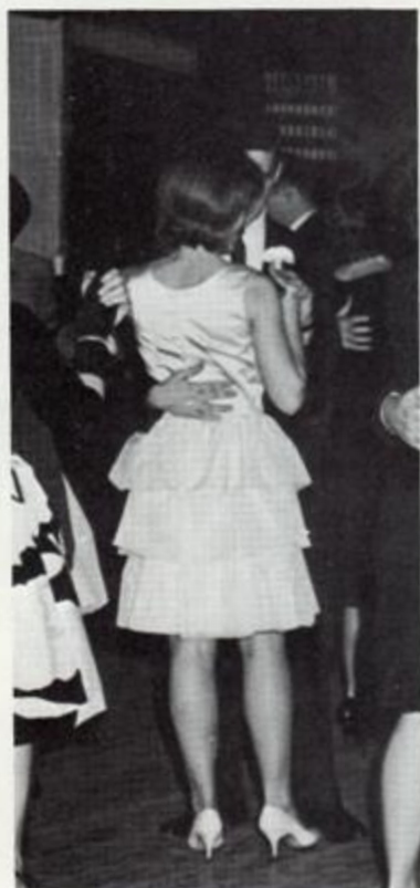
"We could have danced all night....."