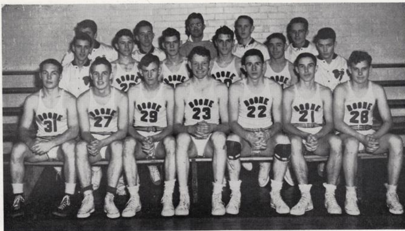
VARSIY BASKETBALL SQUAD