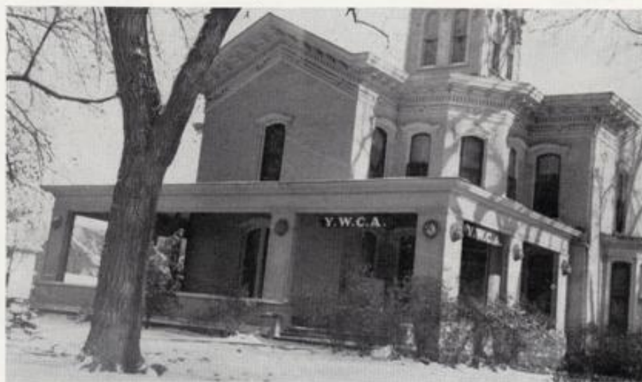
Y. W. C. A. Building