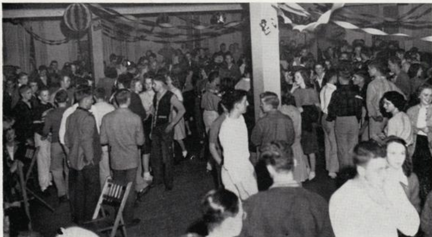
A representative group at the Moose Dance