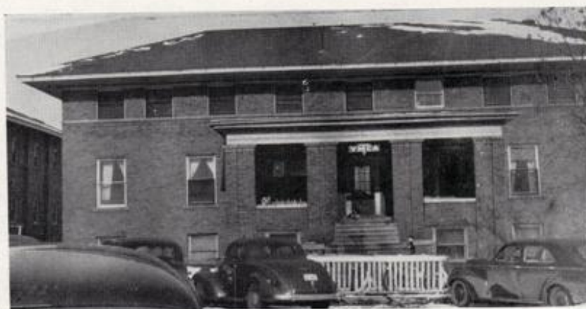
Y. M. C. A.