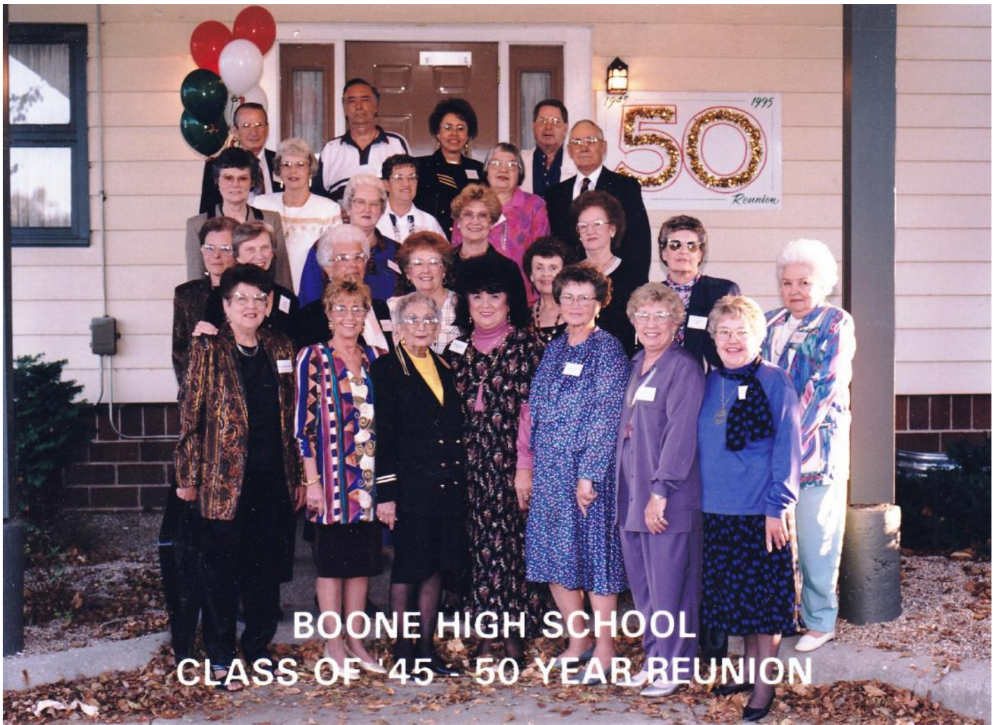
BOONE HIGH SCHOOL CLASS OF '45 - 50 YEAR REUNION