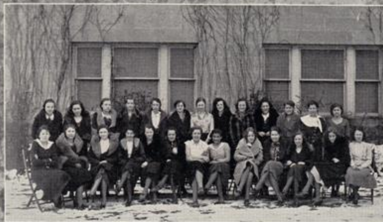
Second Glee Club