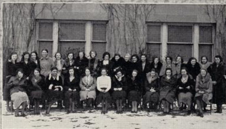
First Glee Club