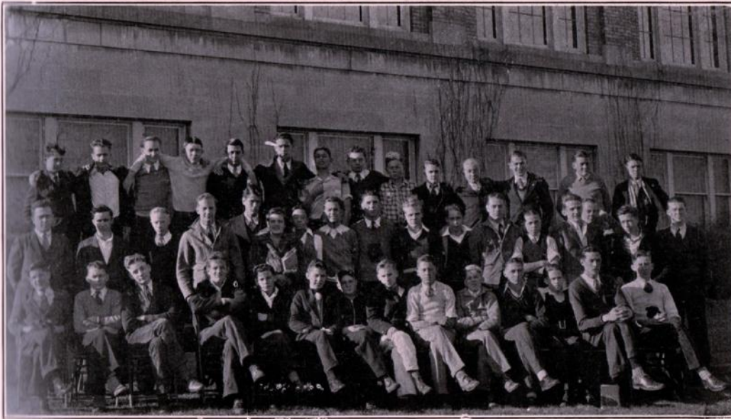
SENIOR HIGH GLEE CLUB