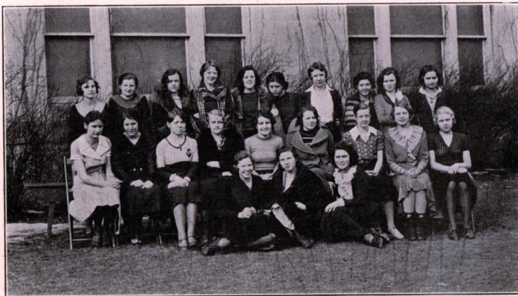
FIRST GLEE CLUB