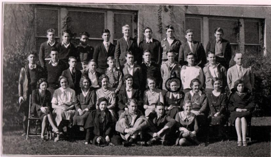
FIRST SEMESTER STUDENT COUNCIL