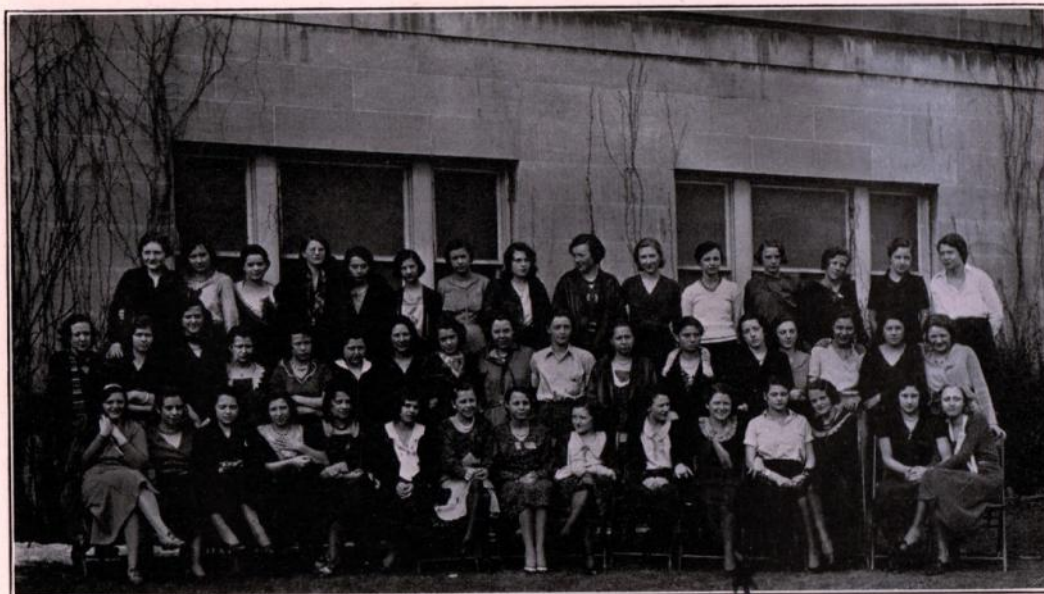
SECOND GLEE CLUB