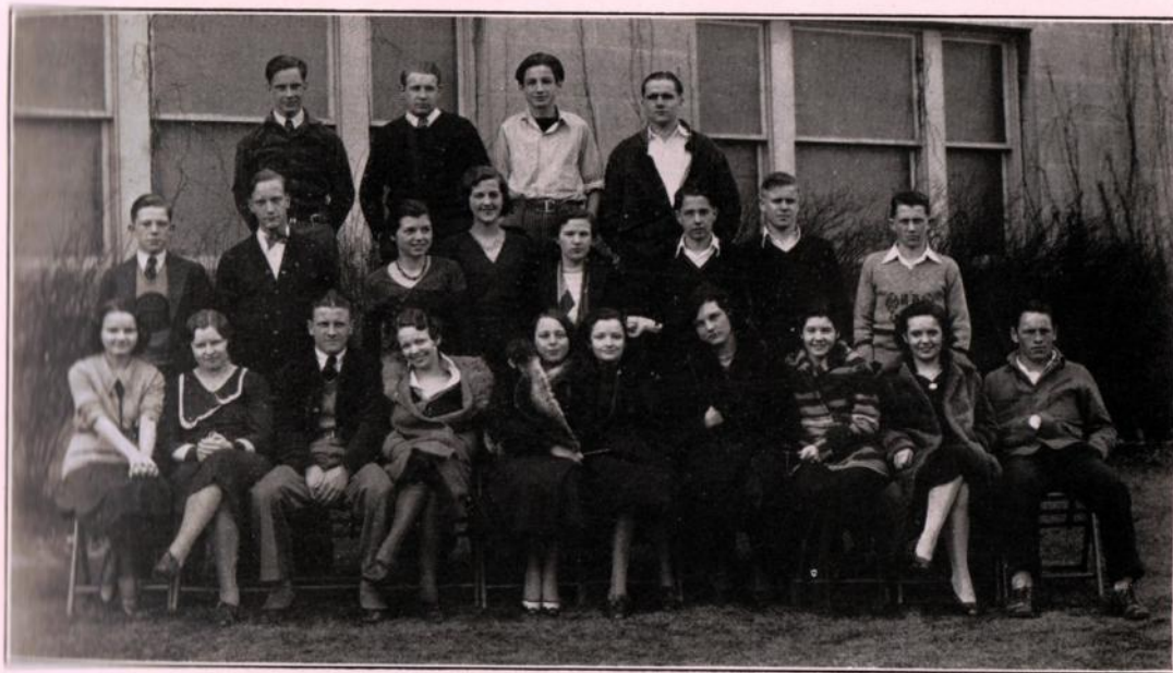
SECOND SEMESTER STUDENT COUNCIL