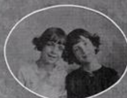
When we were Kids