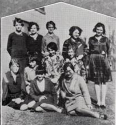
"We love the college girls"