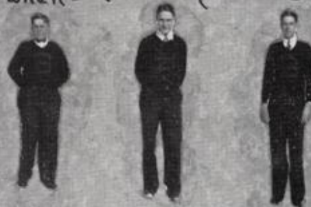
The 1929 Yell Leaders