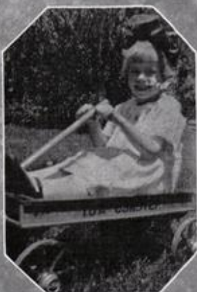
"Barney" in '17