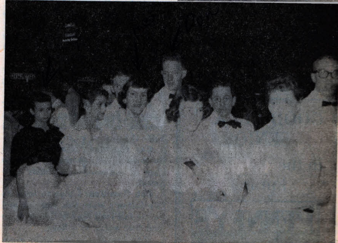
Prom Goers Entering the Rialto Theatre