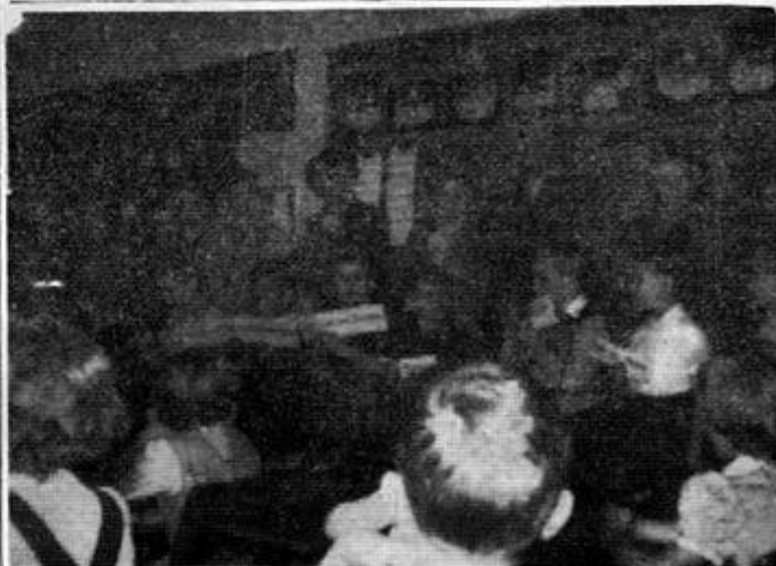
In the above picture are the second grade trainmen as they presented their "Religion Train" for the Education Week open house.

Reports on other projects will appear in the next issue of Listening In.