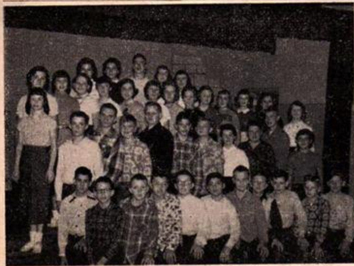
MEMBERS OF CAST FOR "A KING IS BORN"