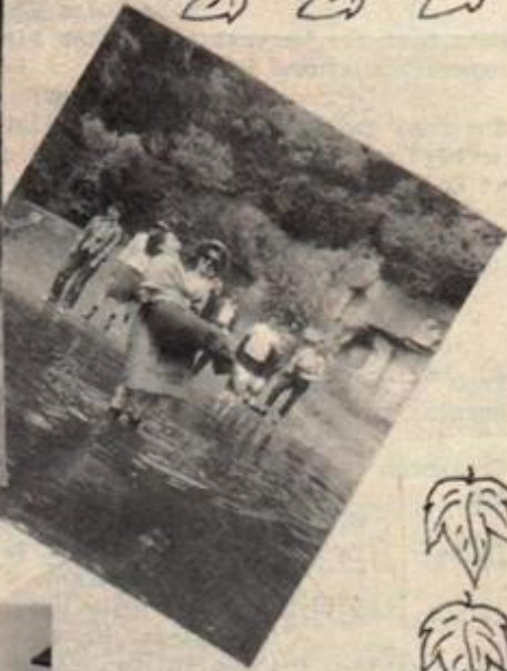
THAT FATAL DAY