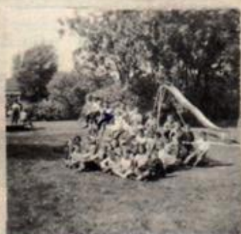
1 ST AND 2 ND