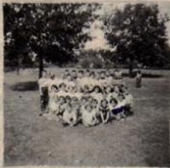
3 RD AND 4 TH