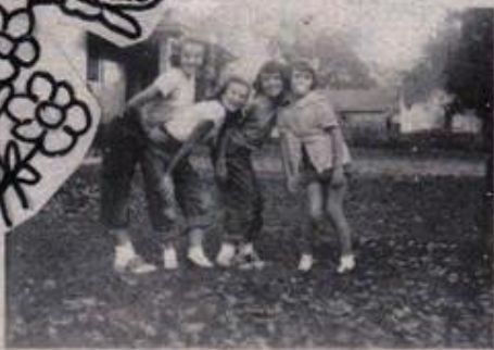
A good time was had by all!