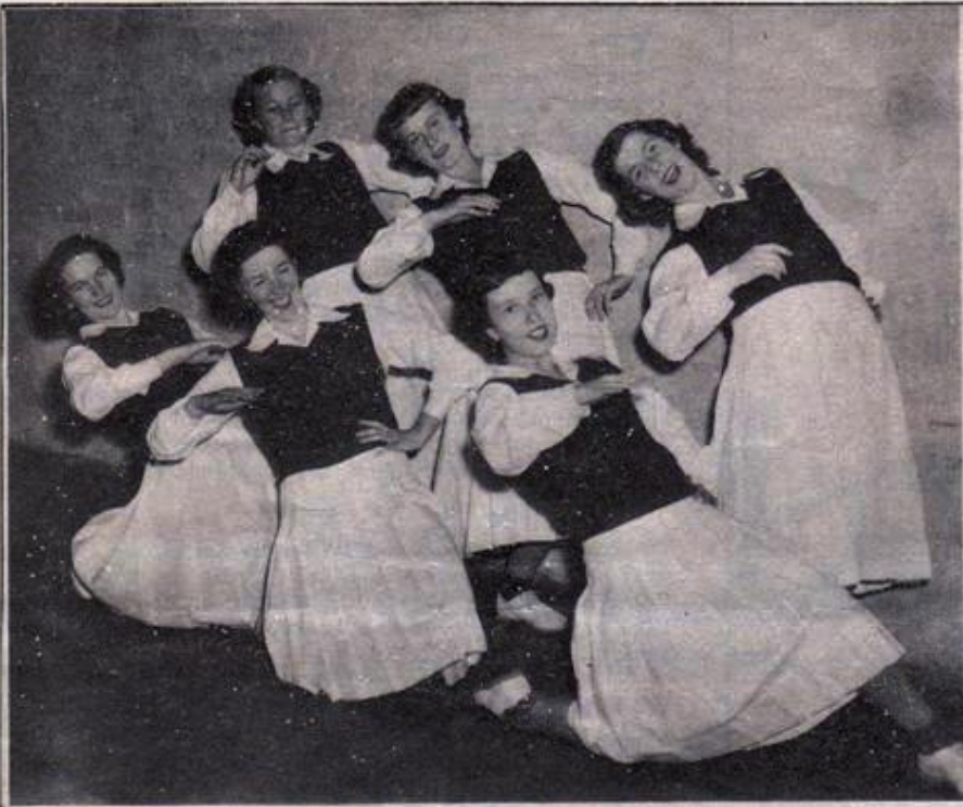
Rah! Rah! Rah!