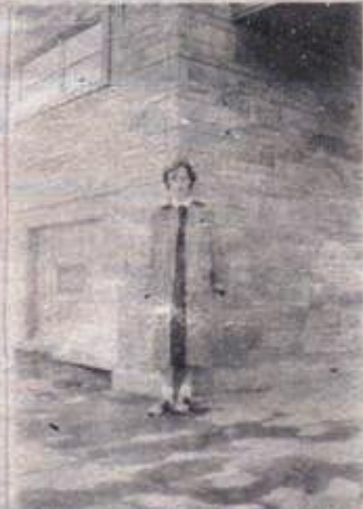
Chip off the old block.