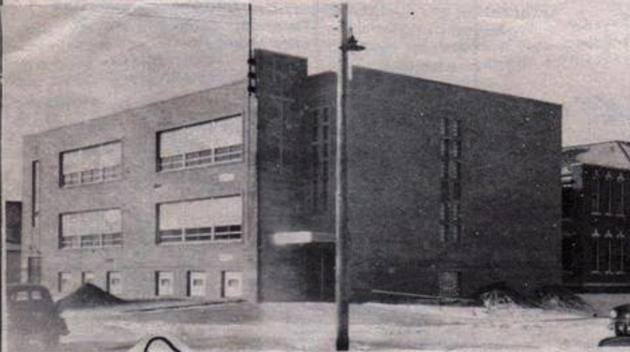
Sacred Heart School