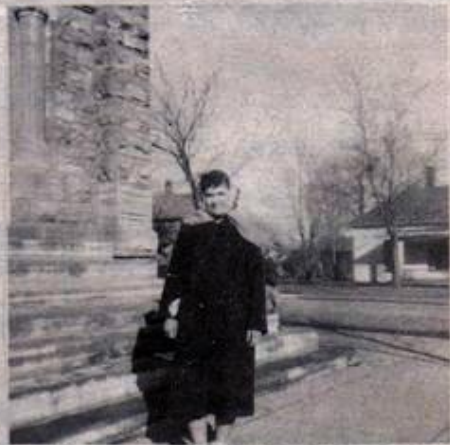
Do you know me?