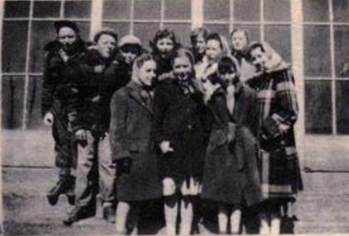
Some Seventh and Eighth Graders Pose.