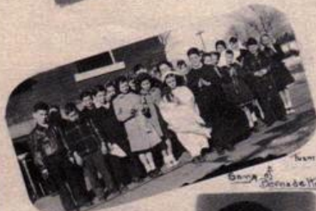
Sam Group of Children