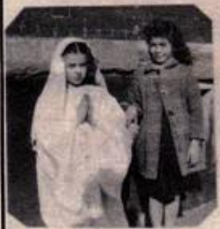
Blessed Mother and Bernadette