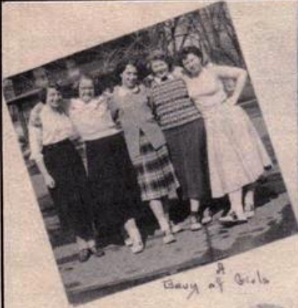
A Group of Girls