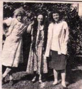
Anybody You Know?