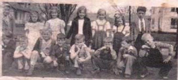
Meet The Second Grade