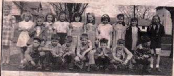
Here's The Third Grade